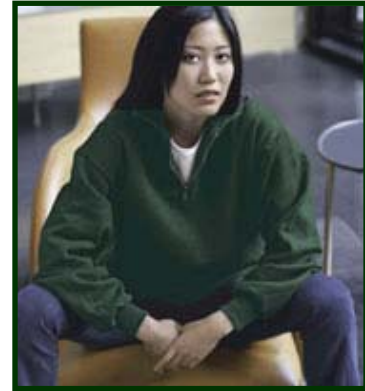
JERZEES Half Zip Pullover Fleece Sweatshirt