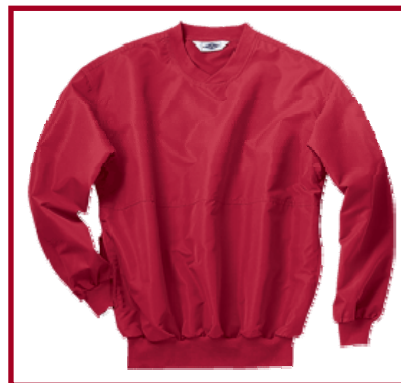
River's End Microfiber Windshirt