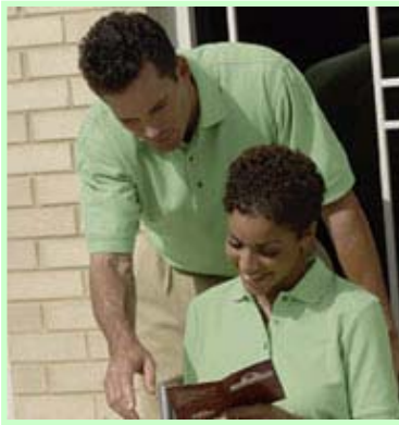
PGA TOUR Solid Pique Sport Shirt (Available in Men's and Women's Styles)