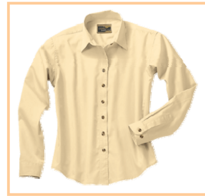
River's End Easy-Care Long-Sleeve Shirt (Available in Men's and Women's Styles)