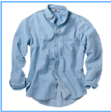
River's End Denim Long-Sleeve Shirt